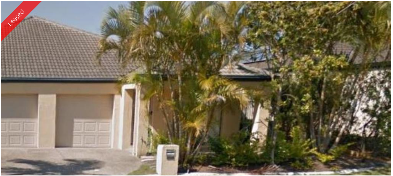
Unit 2, 25 Inwood Cct, Merrimac