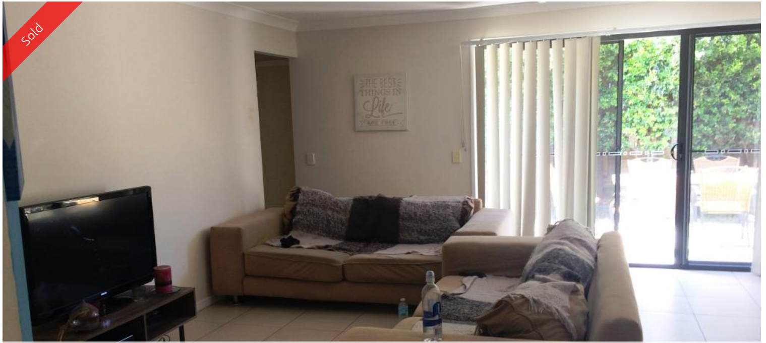
2, 2 Success Cres, Ormeau