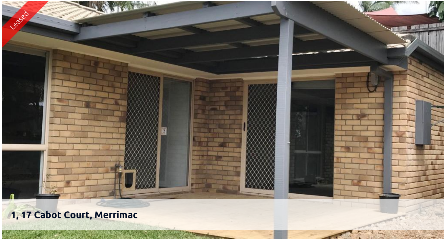
1, 17 Cabot Court, Merrimac