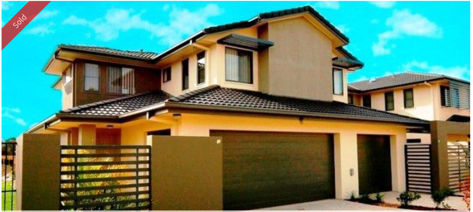
Unit 48, Lot 2 Catalina Way, Upper Coomera