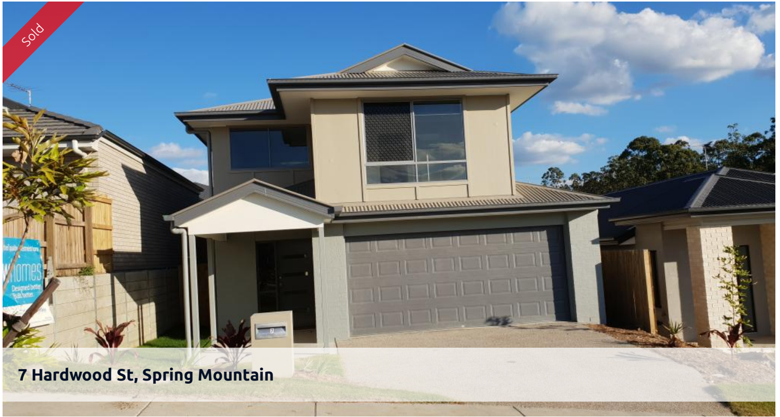
7 Hardwood St, Spring Mountain