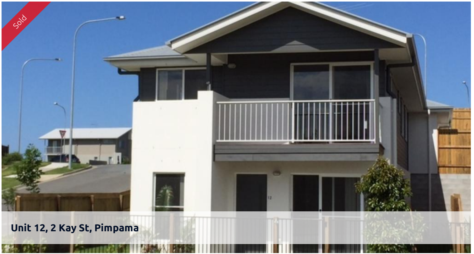
Unit 12, 2 Kay St, Pimpama