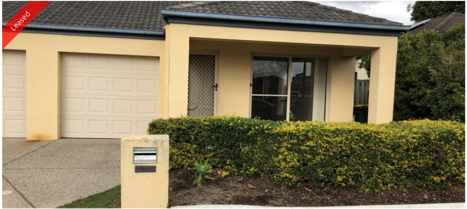
Unit 2, 25 Inwood Cct, Merrimac