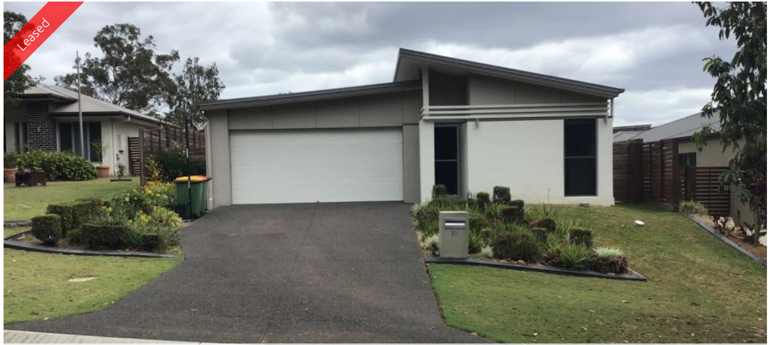
13 Brigalow Pl, Mount Cotton