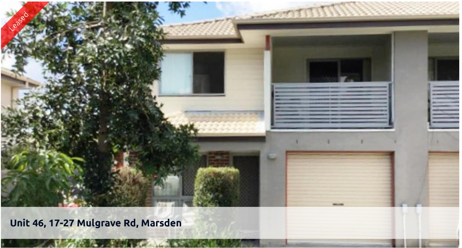
Unit 46, 17-27 Mulgrave Rd, Marsden