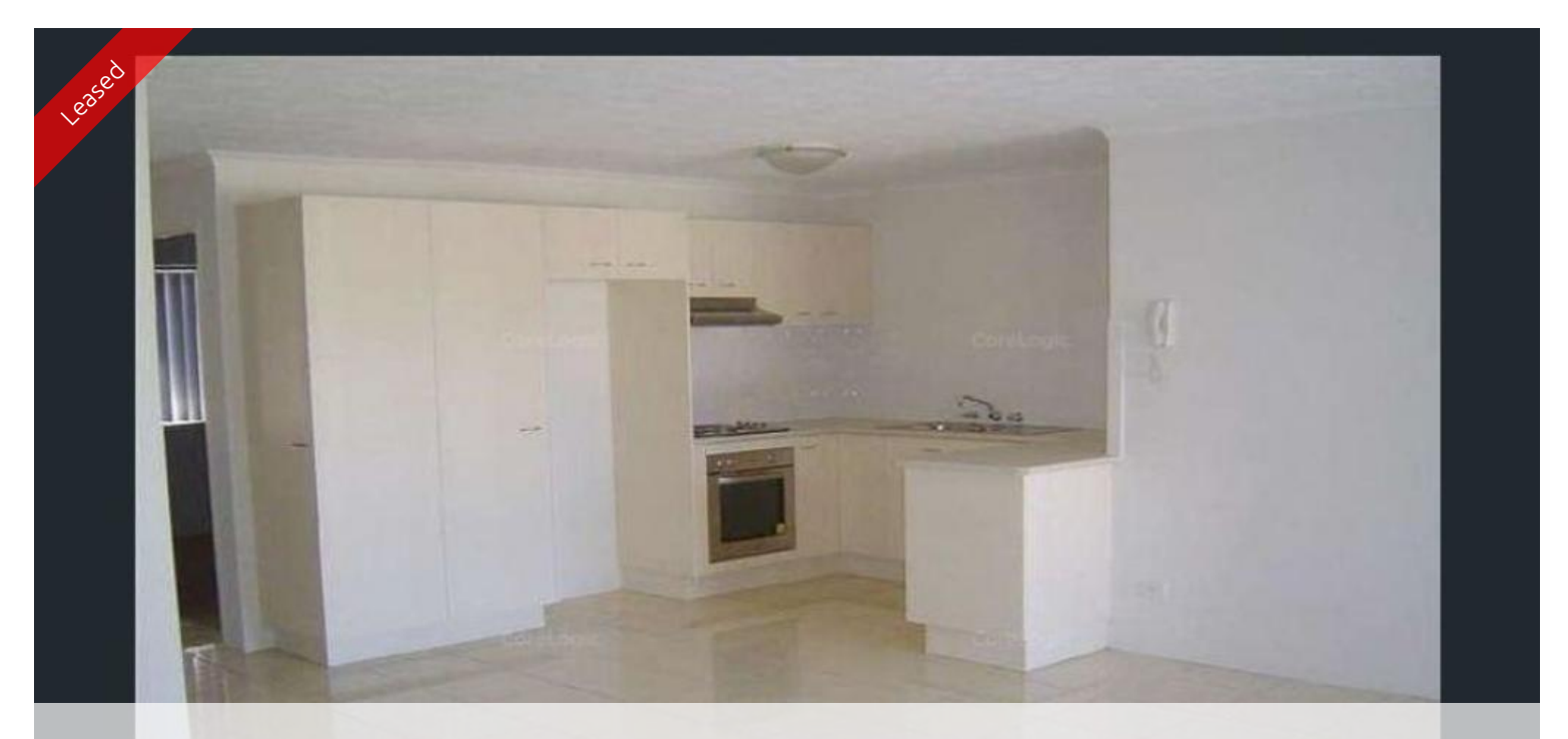
Unit 8, 9 Bradford St, Labrador